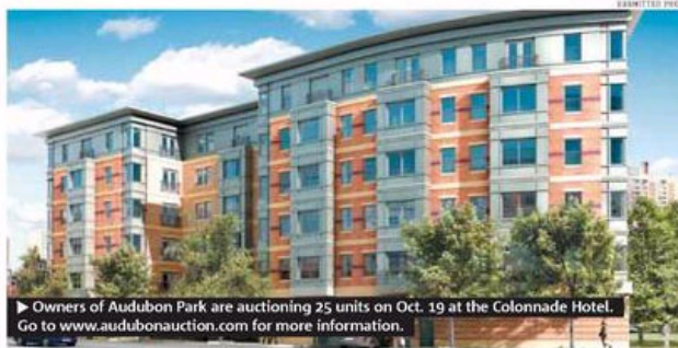
► Owners of Audubon Park are auctioning 25 units on Oct. 19 at the Colonnade Hotel. Go to www.audubonauction.com for more information.

"They felt that since they were able to buy it at an